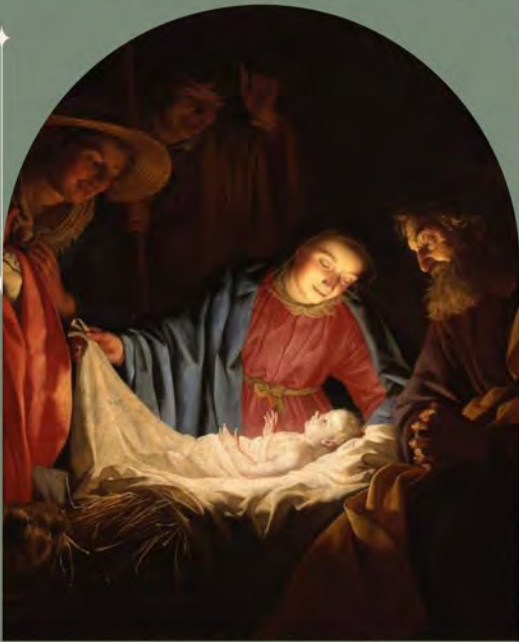
FROM THE PARISH OFFICE STAFF

May the birth of Christ bring immense graces into your life this year!