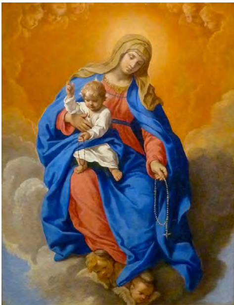
THE FEAST OF OUR LADY OF THE ROSARY IS OCTOBER 7!