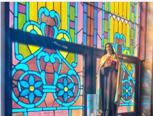
St. Therese's statue at St. Mary with the last of the evening sunlight.